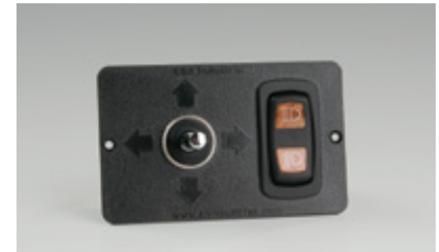
New and improved control panel for the NightRay hardwired and dual- control, Cat. No. KH200-133.

Works from up to 100' away! Toggle between spot/flood and control lamphead rotation. Weather-tight and easily clips to clothing or dash.